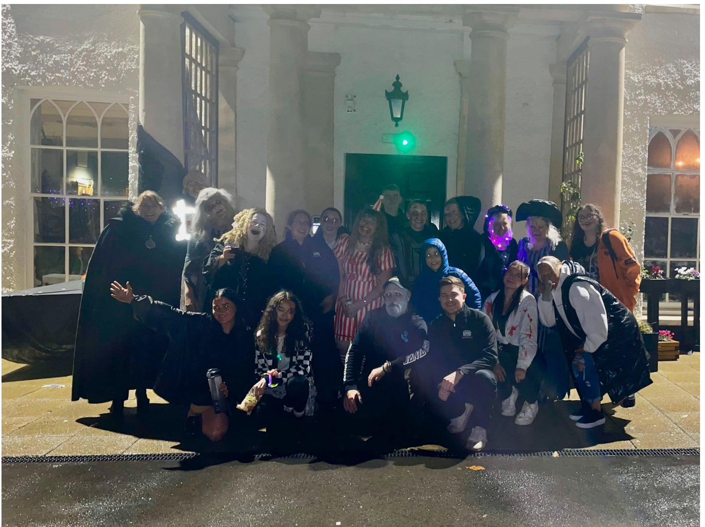
A mixture of staff, volunteers and youth group members who took part in Llanrumney Hall's Haunted House of Horrors Halloween event.