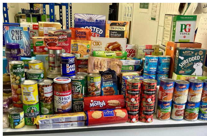
A generous donation of food for The Pantry from St. Dyfrig's Church.