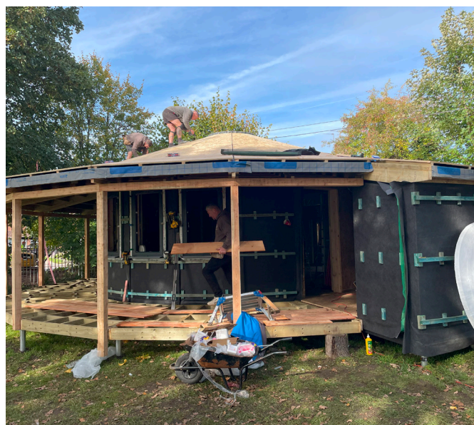
Our Health & Wellbeing Roundhouse in construction.